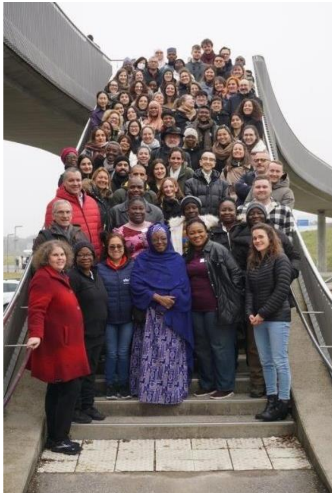
Adult Education Academy Participants (See inside)